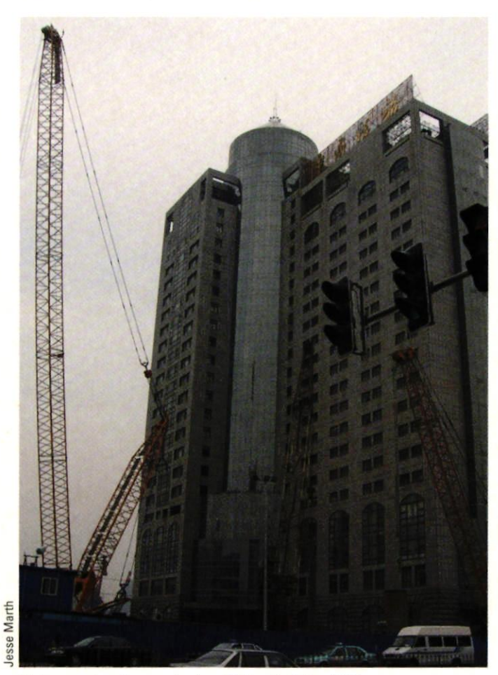
Make constructive contacts at China Building 2006

An international faculty of import/export compliance professionals, attorneys, and senior government officials will present perspectives on navigating both US and PRC customs regulations. Hot topics include China's expanded trade and distribution rights and US enforcement of export controls. Post-conference